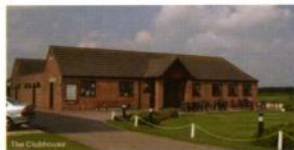
South Kyme Golf Club

Phone: 01526 861113 Fax: 01526 861080 Email: southkymegc@hotmail.com Web: www.skgc.co.uk