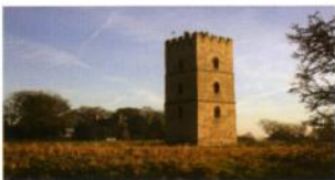
South Kyme Tower dating back to 1310.

We offer potential Members the chance to join on a fantastic trial membership to see if the course and club suits their golfing needs. Please check website of call for details