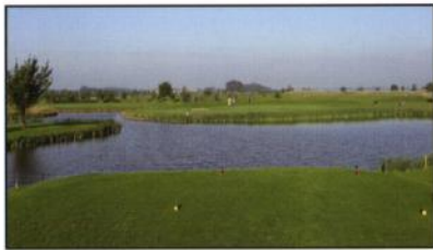
Take the challenge of the 14th Hole, its just over 100 yards but you must take the aerial route!

The course stretches to nearly 6600 yards from the white tees